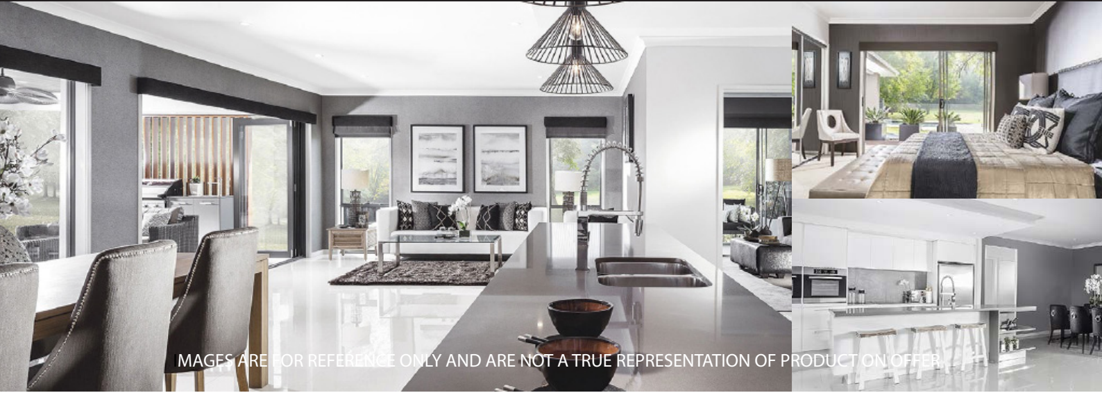
IMAGES ARE FOR REFERENCE ONLY AND ARE NOT A TRUE REPRESENTATION OF PRODUCT ON OFFER